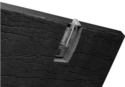
Sound Insulation for Less Noise