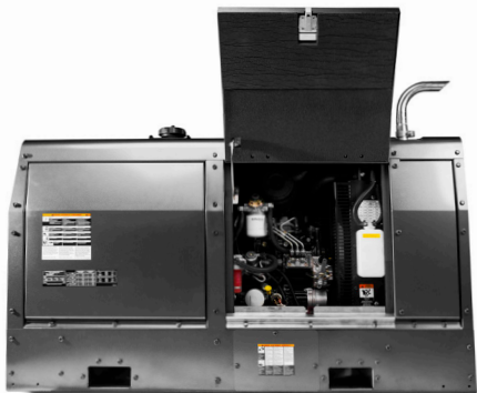
Easy Access Panel for Servicing