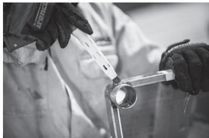
Propel Torch sold separately