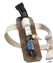
3M™ Heating Vortex Assembly V-200