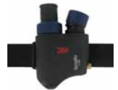
3M™ Versaflo™ V-500E Regulator