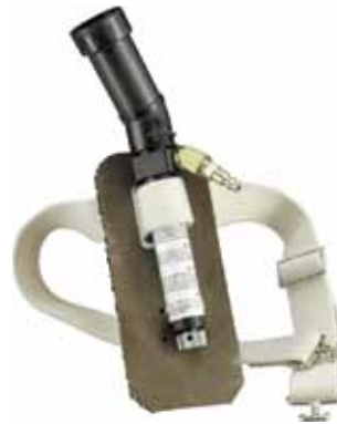
V-100 Cooling Vortex