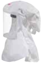
3M™ Versaflo™ S-433/533 Integrated Hoods