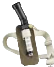
3M™ Cooling Vortex Assembly V-100