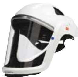
3M™ Versaflo™ M-100 Series Faceshields for respiratory, eye and face protection:

M-106 features a comfortable faceseal for dusts, spraying and chemical processing. Fabric material: polyurethane coated polyamide.