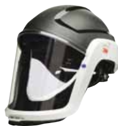
3M™ Versaflo™ M-300 Series Helmets for respiratory eye, face and head protection:

M-107 features a flame resistant faceseal for applications with hot particles. Fabric material: flame resistant polyester.