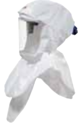
3M™ Versaflo™ S655/657/757/855E Reusable Suspension Hoods