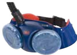
3M™ Jupiter™ Powered Air Respirator