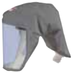
3M™ Versaflo™ S-133/333G Integrated Headcover