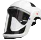
3M™ Versaflo™ M-106/107 Faceshields