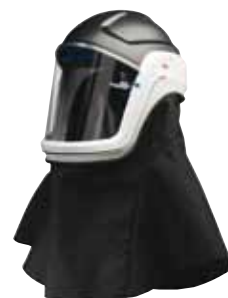
3M™ Versaflo™ M-400 Series Helmets with shrouds for respiratory, eye, face and head protection with additional neck and shoulder coverage:

M-307 features a flame resistant faceseal for applications with hot particles. Fabric material: flame resistant polyester