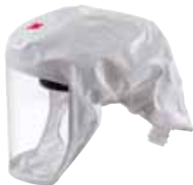
3M™ Versaflo™ S-133 Headcover General purpose, cost-effective fabric.

Ready to use straight out of the box. Permits fast replacement of soiled hoods Available in two adjustable sizes: Small (S) and Large (L)