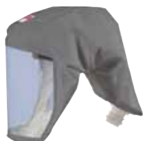
3M™ Versaflo™ S-333G Headcover Soft, quiet, more durable low-linting fabric.

Fabric material: Polypropylene coated non-woven polypropylene. Visor material: PETG.