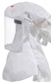
3M™ Versaflo™ S-433 Hood Includes neck and shoulder coverage.

Fabric material: Polyurethane coated knitted polyamide. Visor material: Coated polycarbonate. for increased chemical and scratch resistance.