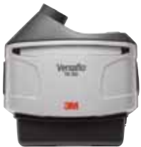
3M™ Versaflo™ TR-300 Powered Air Respirator