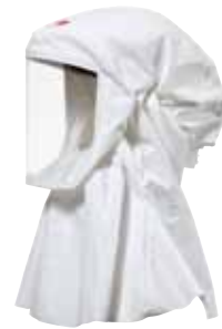
3M™ Versaflo™ S-533 Hood Neck and shoulder coverage with soft, low-linting fabric that more readily drapes over user.

Fabric material: Polypropylene coated non-woven polypropylene. Visor material: PETG.