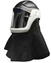
3M™ Versaflo™ M-406/407 Helmets with Shrouds