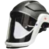
3M™ Versaflo™ M-306/307 Helmets