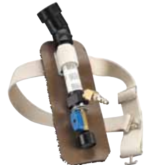
V-200 Heating Vortex

Please see the data on the headtop used with the unit for information on protection factors.