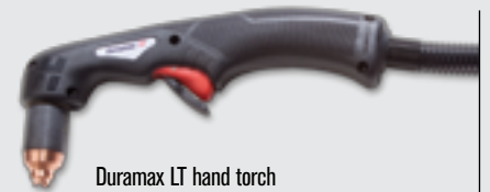
Duramax LT hand torch