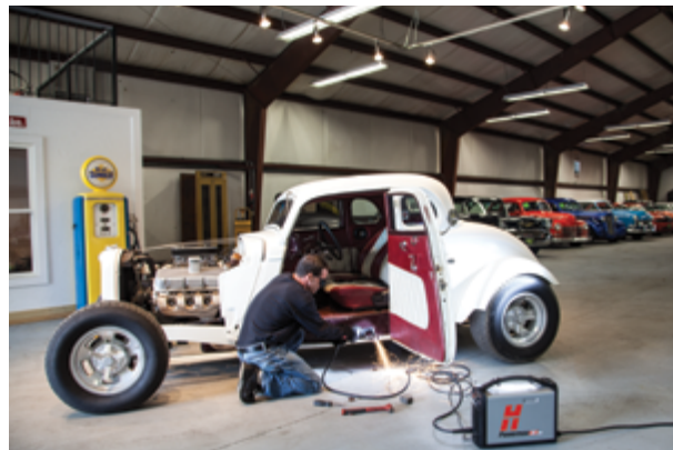
Vehicle repair and modification