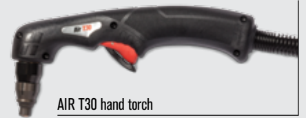
AIR T30 hand torch