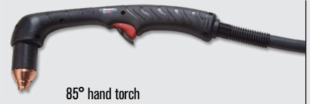
85° hand torch

Duramax Hyamp standard torch styles (for more torch options, see www.hypertherm.com )